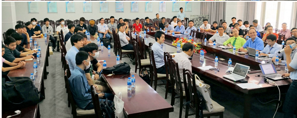
Opening ceremony of gPBL at HCMUT