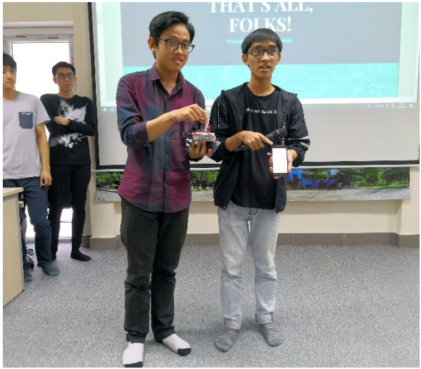
Examples of system development