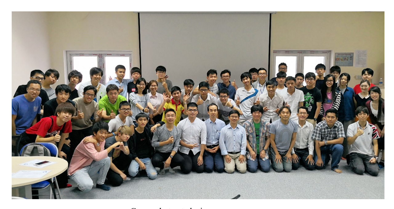
Group photo at closing ceremony