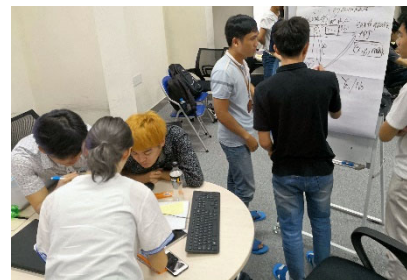
Brainstorming and discussion to set their goals of gPBL