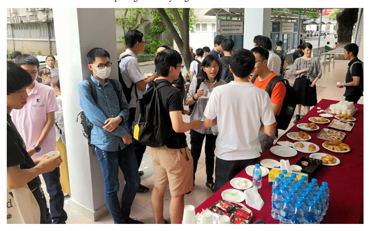
Ice-breaking after the opening ceremony