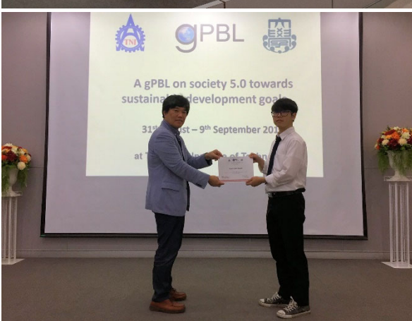
Giving the certificate of completion to participants at the closing ceremony