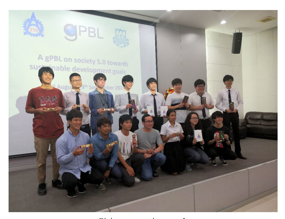
Giving presentation awards