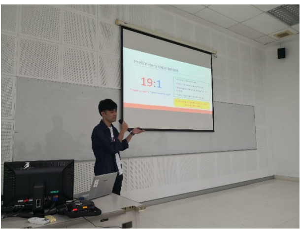
Presentation of ongoing research at the research workshop