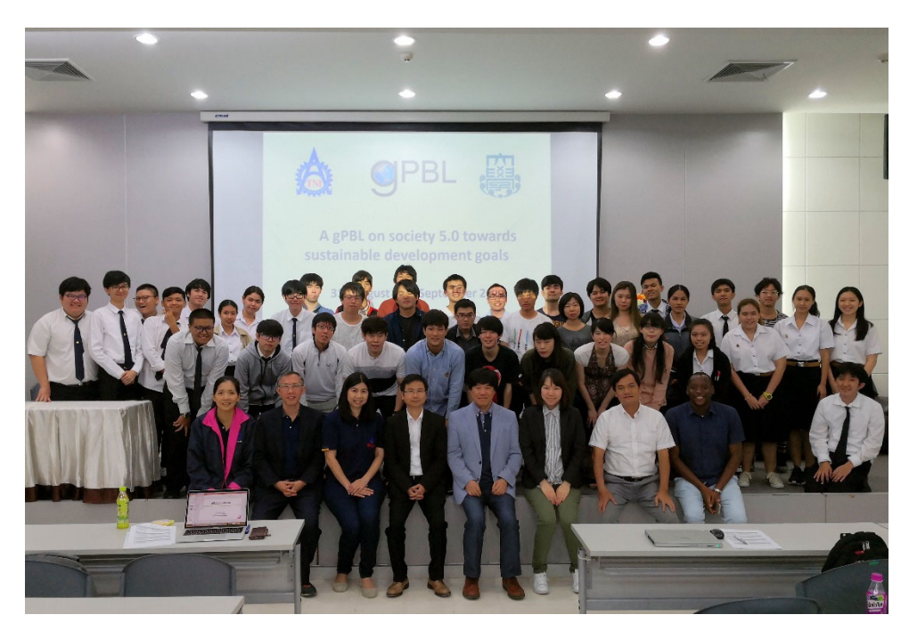
Final photo session