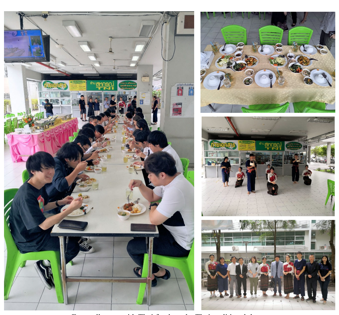
Farewell party with Thai foods and a Thai traditional dance