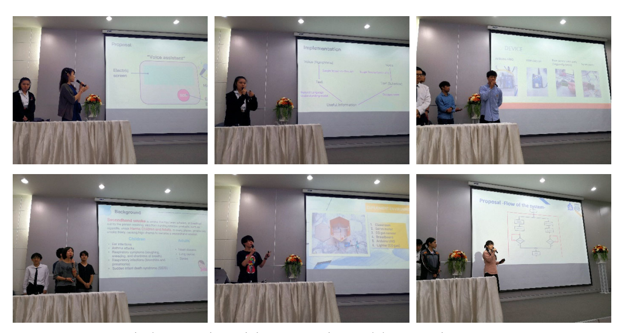
Final presentation: Giving presentations and demonstrations