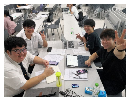
AgPBL activity: Clarification of the issues on Society 5.0