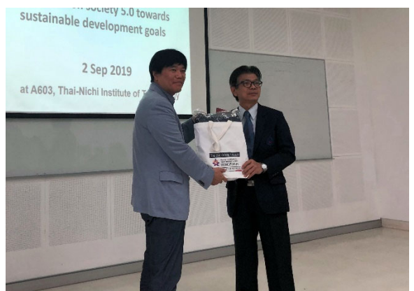
Introduction to each university at the opening ceremony